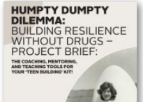
“HUMPTY DUMPTY RESILIENCE EDUCATION” MENTORING PROGRAM