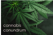
NATIONAL SPEAKING TOUR WITH INTERNATIONAL GUESTS “THE CANNABIS CONUNDRUM