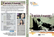
“I WISH I NEVER” CURRICULUM